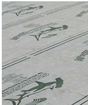
Sharkskin Ultra SA ®

SHARKSKIN ® Ultra SA All Weather Barrier™