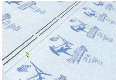
Sharkskin Ultra ®