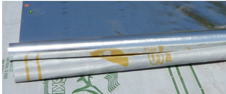
Sharkskin Ultra Radiant ®

SHARKSKIN ® Ultra SA All Weather Barrier™