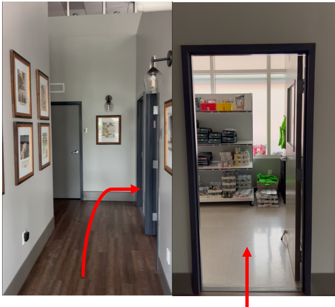
First door on the right is Exam Room 1, 2 nd door is new proposed traffic direction (red arrow showed current employee only entrance), and door straight ahead is another exam room