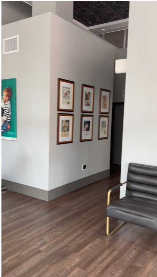
Picture showing height of ceiling when standing in the lobby and a small amount of glass wall of existing mezzanine floor