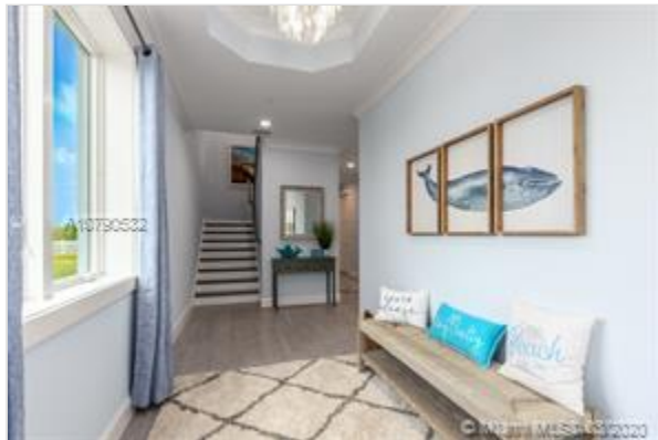
Welcome to your new beach home!