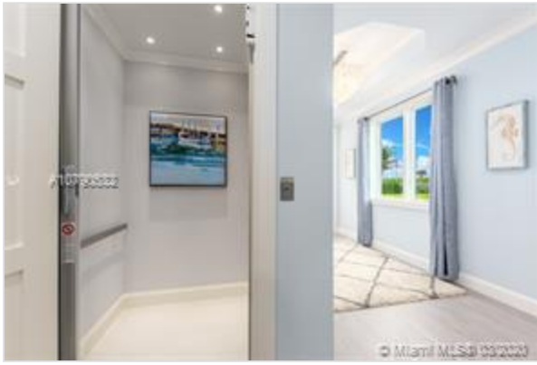
Elevator accesses all 3 floors in this home.

4832 Watersong Way, Fort Pierce , FL 34949 MLS Number: A10790532