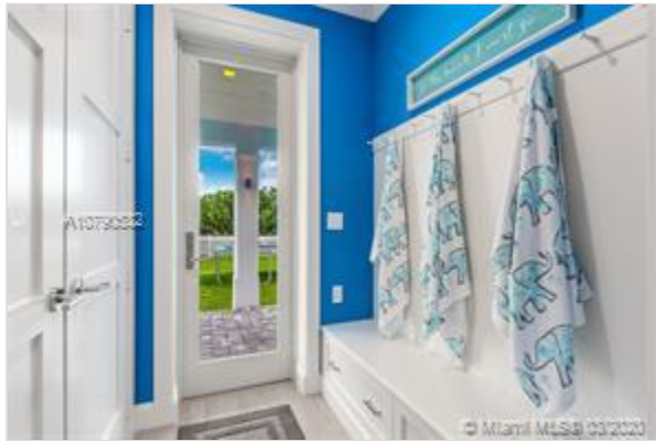
Entryway to the backyard.