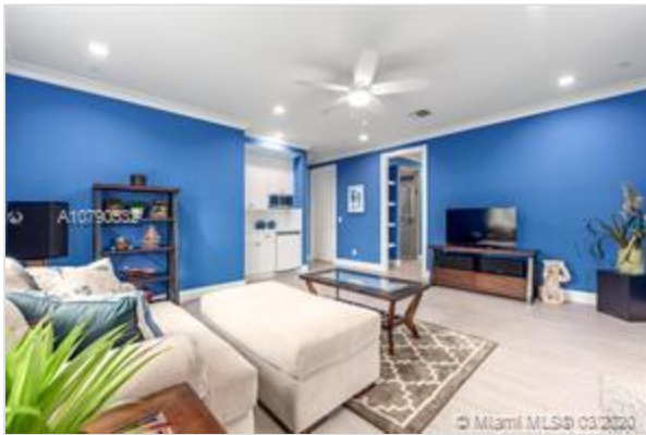
In-Law suite, media room, or home office...you choose.