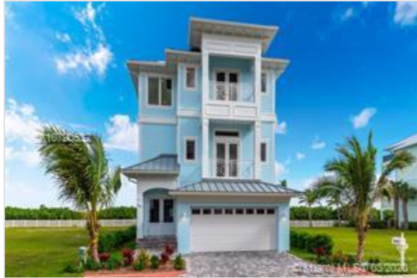
British West Indies exterior with solid concrete construction.