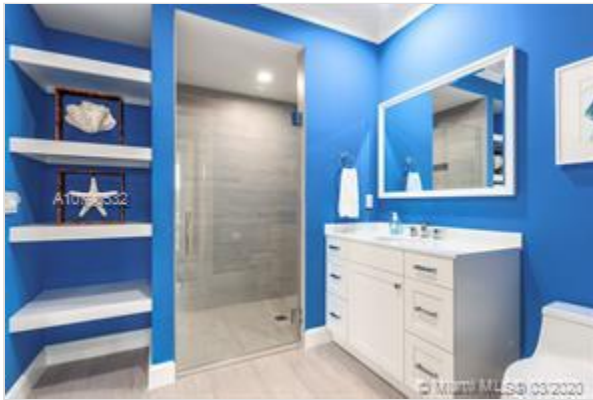
First floor bathroom/cabana bath.