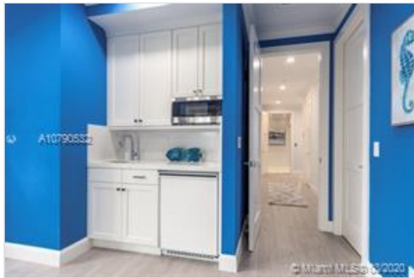
First floor kitchenette with sub-zero refrigerator.