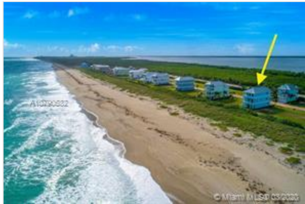
Enjoy the wide beaches at this private enclave on North Hutchinson Island.