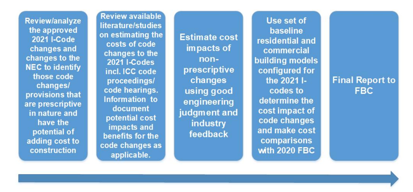
Figure 1. Research Plan

This research provides an assessment of the potential cost impacts of the 2021 I-Code changes to the 2018 International Building Codes as incorporated in 2021 Florida Building Code (effective December 31, 2020) by identifying those code changes/provisions that are prescriptive in nature and have the potential of adding cost to construction and by estimating the costs of the rest of the code changes using good engineering judgment and feedback from general contractors and consulting. A standard set of baseline residential and commercial building designs are modeled using building information modeling (BIM) and are used to produce cost estimates and extract the cost impact of code changes. Figure 1 shows the general process used to conduct this research.