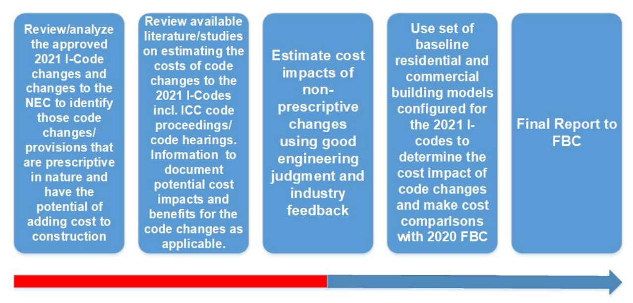
Figure 2. Research progress to date.

Work completed on the project at this point includes contracting subcontractors, background research and developing tables documenting code changes, benefits and cost. Figure 2 highlights research tasks that have been completed or are in progress at the compilation of this interim report.