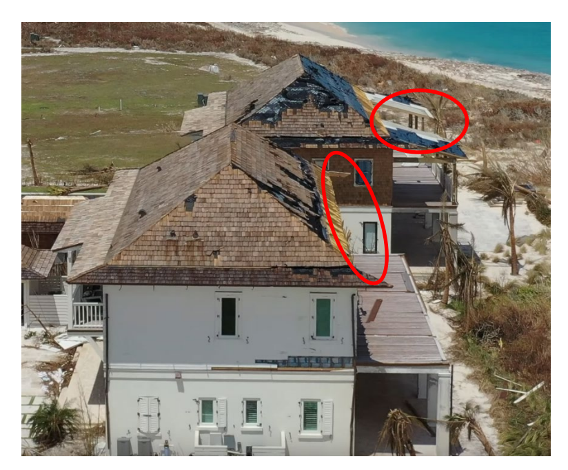
Figure 1. Aerial Footage of Great Guana Cay (Baker's Bay), Abaco after Dorian (retrieved on 2/26/2021 - <u>https://www.youtube.com/watch?v=92PutXku0xU&feature=youtu.be</u>)

The objective of this task is to continue the work done under Phase I (funded by FBCC - Order B83FC1) which considered only a limited number of configurations for physical testing. An informal advisory board (IAB) was formed that included building code officials form Miami Dade, Coral Gables and Broward County, as well as representatives from two major truss manufacturing companies. The feedback that was received by IAB was very valuable in prioritizing overhang geometries that are most common in current construction industry. Moreover, current issues were identified and discussed, such as the wind-induced damage occurred on extended overhangs in Bahamas after Hurricane Dorian's passage (see Figure 1). The seed funding provided by FBC in Phase I was sufficient to carry out a thorough literature survey, test 2 large-scale model configurations at WOW-EF and analyze the acquired data for better understanding of the implication of the recent code changes. Nevertheless, the limited amount of testing cases will not allow us to proceed with a detailed codification process that can lead to potentially valuable design recommendation for enhancement of future wind standards and building codes of practice.