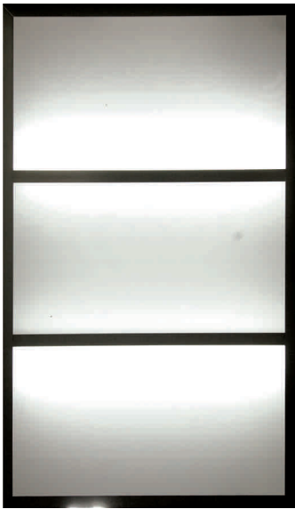
STANDARD Suspended Prismatic Light Diffuser

AVAILABLE UPGRADE: Six (6), nine (9) or 24 down lights with mica, enamel, stainless steel or muntz finishes. For 4000lb capacity cabs and larger, 30, 36 and 40 down lights ceiling options are available.