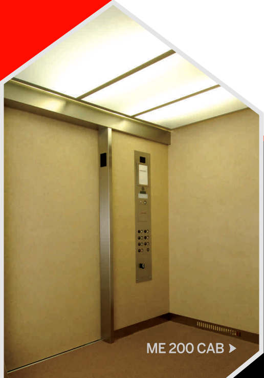
ME 200 CAB ▶