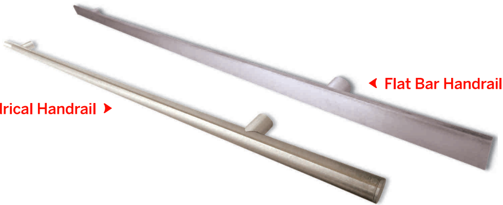
Cylindrical Handrail ▶

AVAILABLE UPGRADE: Upgrade your finish to #8 stainless steel or muntz. Side wall handrails are also available as an optional upgrade.