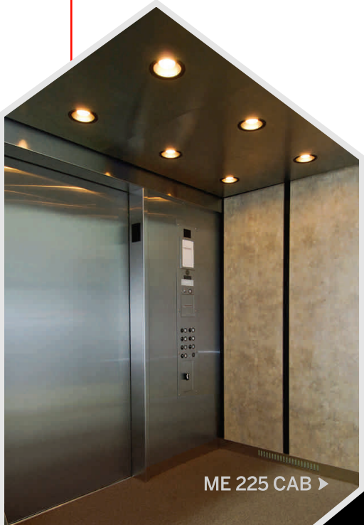
ME 225 CAB ▶

CAB & CEILING HEIGHTS: 8'-0" cab height with 7'-6" ceiling