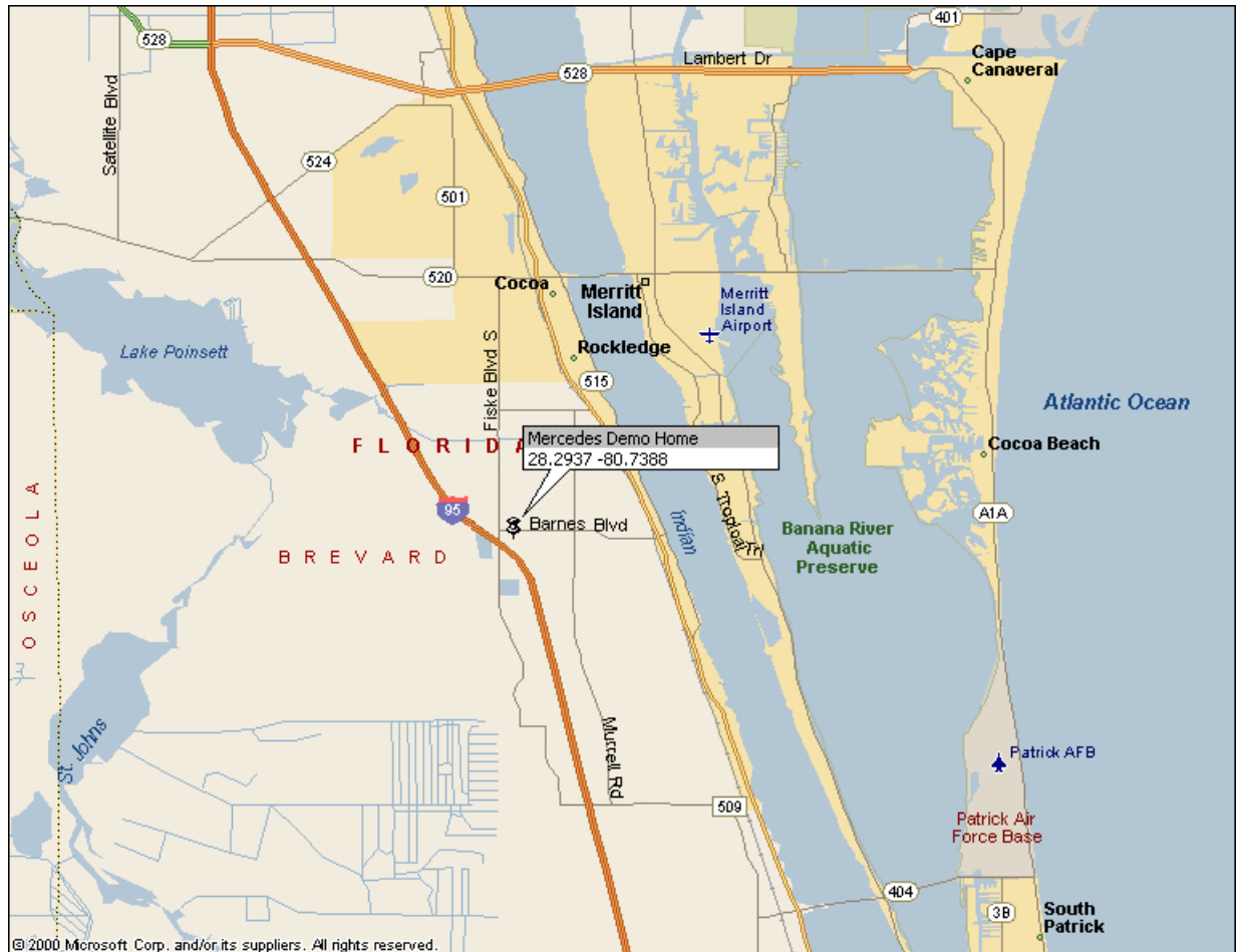
Figure A-1. Location of Mercedes Demonstration Home in Brevard County

The house built in Part I of the project by Mercedes Homes, Inc. in Rockledge, Florida, is a single-family 2,230 Total Square Foot home. It was constructed of concrete block with stucco finish, wood roof trusses and plywood roof deck covered with asphalt shingles. It is located approximately 2.5 miles from the intercoastal waterway as shown in Figure A-1.