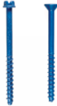
Figure 1 - Titen HD®2 Screw Anchors