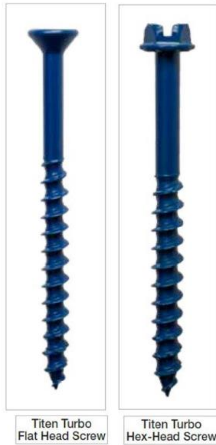
Figure 1 - Titen Turbo™ Screw Anchors