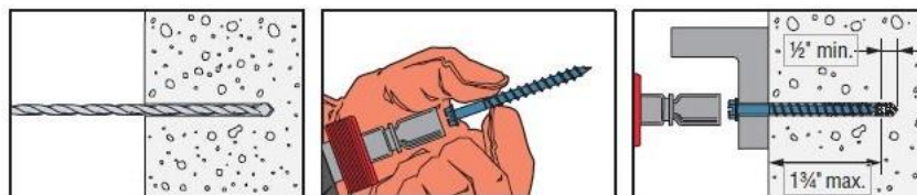
Figure 2 – Installation Instructions for Titen Turbo™ Screw Anchors