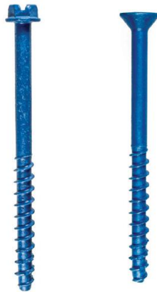
Figure 1 – Titen®2 Screw Anchors