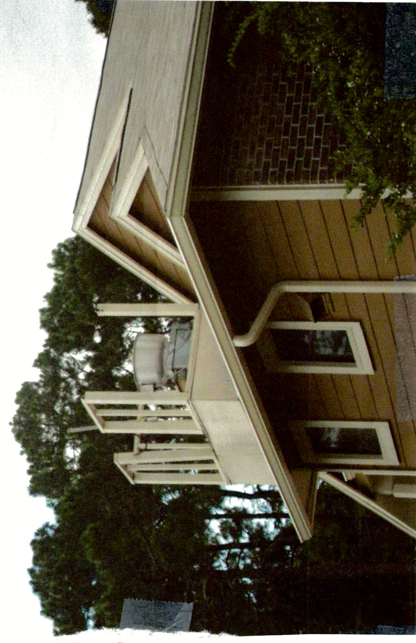
EXISTING EXHAUST FAN (TO BE REMOVED)