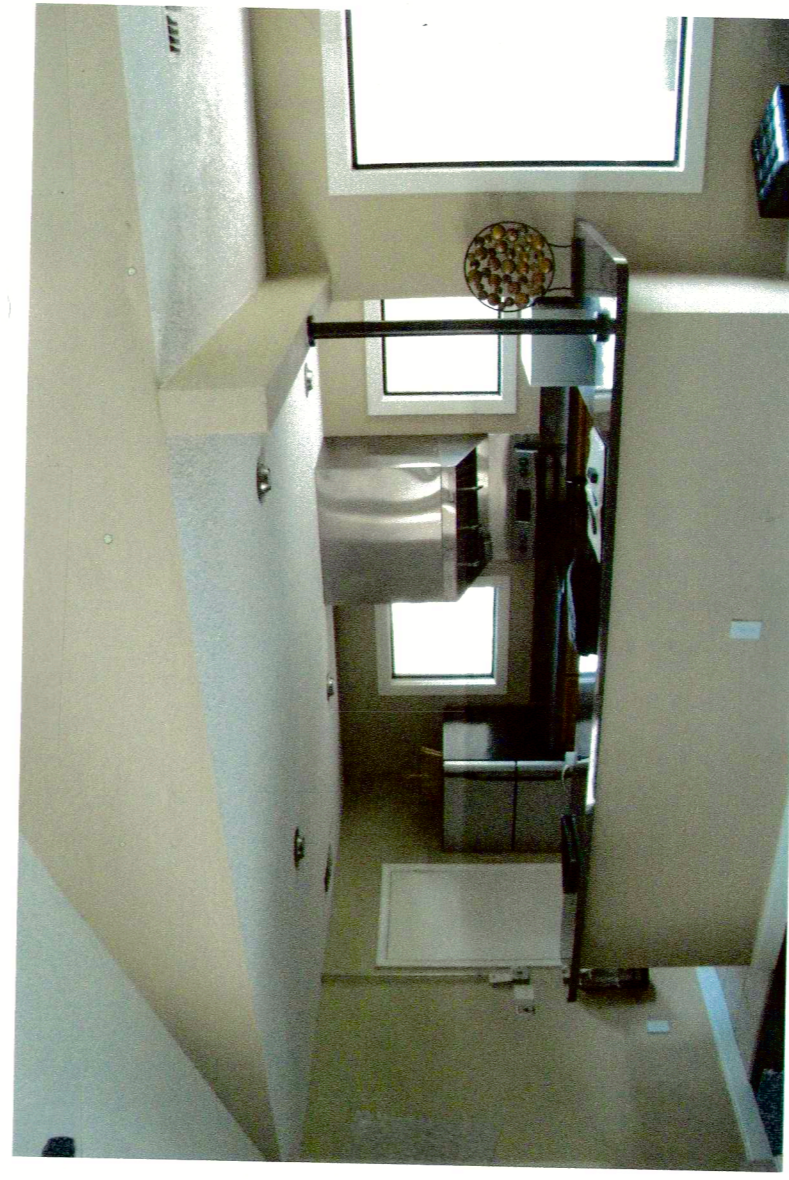
EXISTING RANGE & HOOD (TO BE REMOVED)

Decal or sign must be within 24 inches of the main door not higher than 6 feet and not lower than 4 feet.