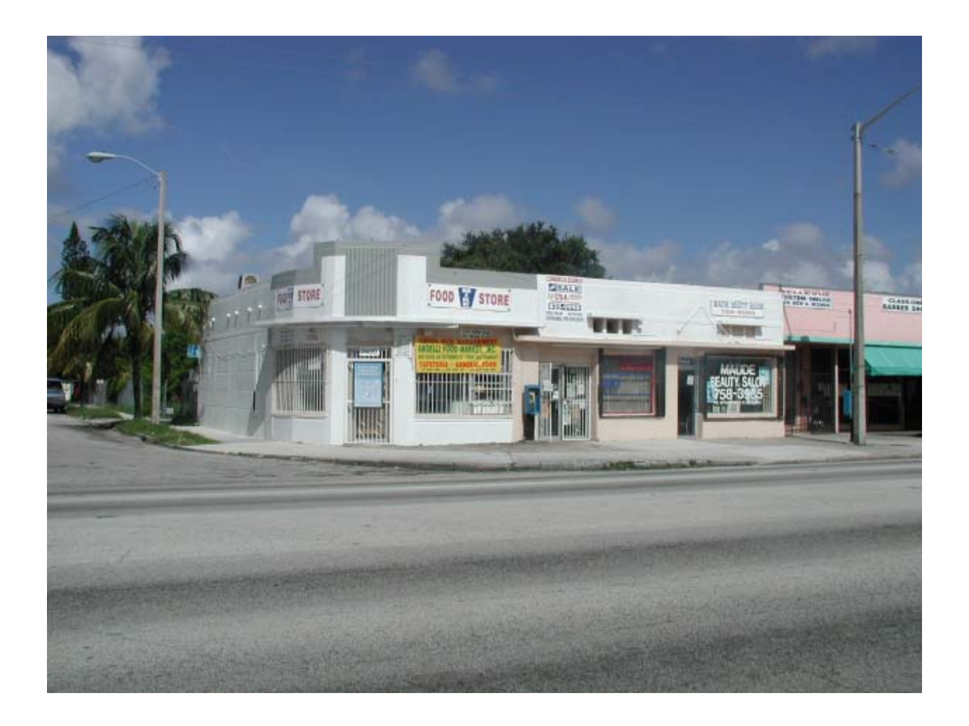
Figure 2. 7400 Biscayne Boulevard, 1936 Moderne