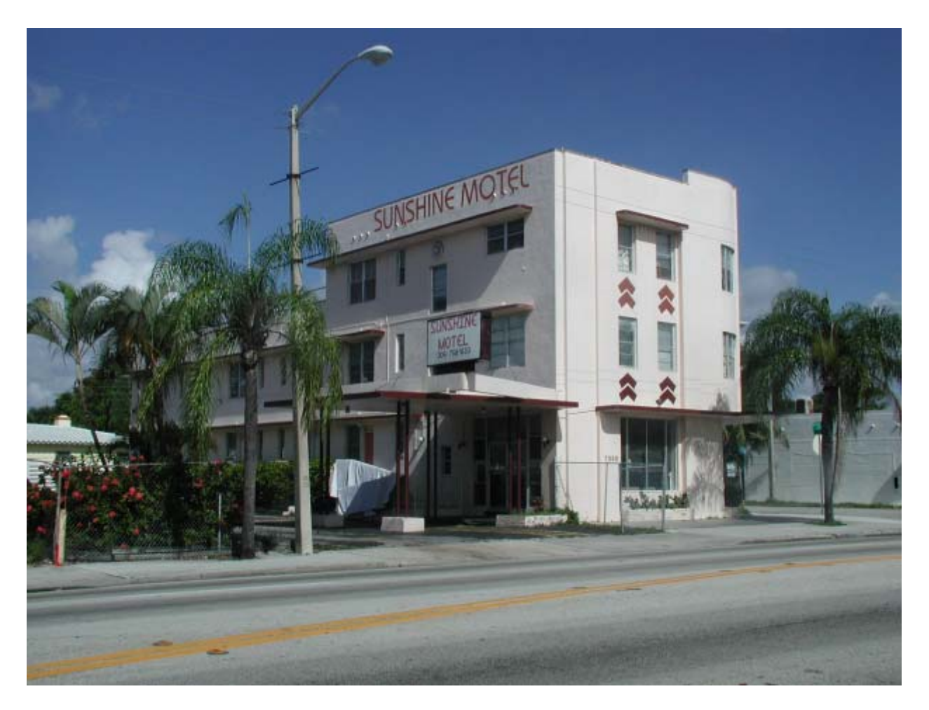
Figure 10. The Sunshine Motel 7350 Biscayne Boulevard, 1939 Art Deco