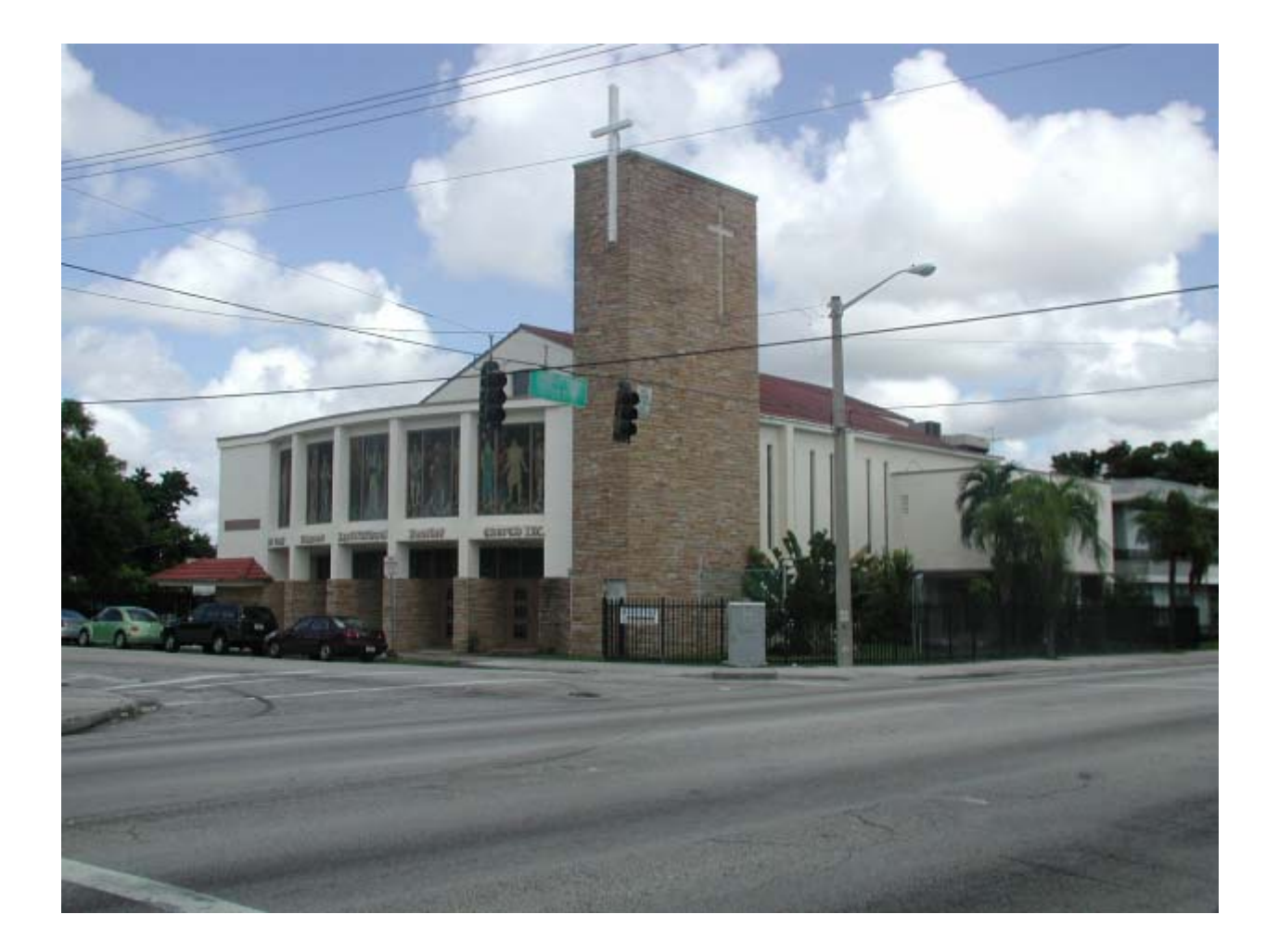
Figure 3. New Mount Pleasant Baptist Church 7610 Biscayne Boulevard, 1951 Sub Tropical Modernism