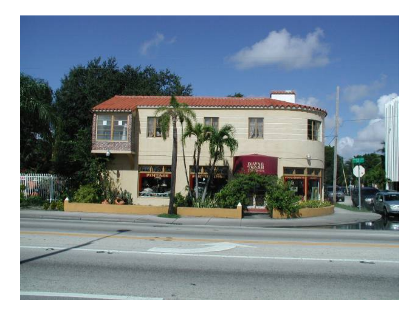
Figure 5. 7244 Biscayne Boulevard, 1935 Art Deco