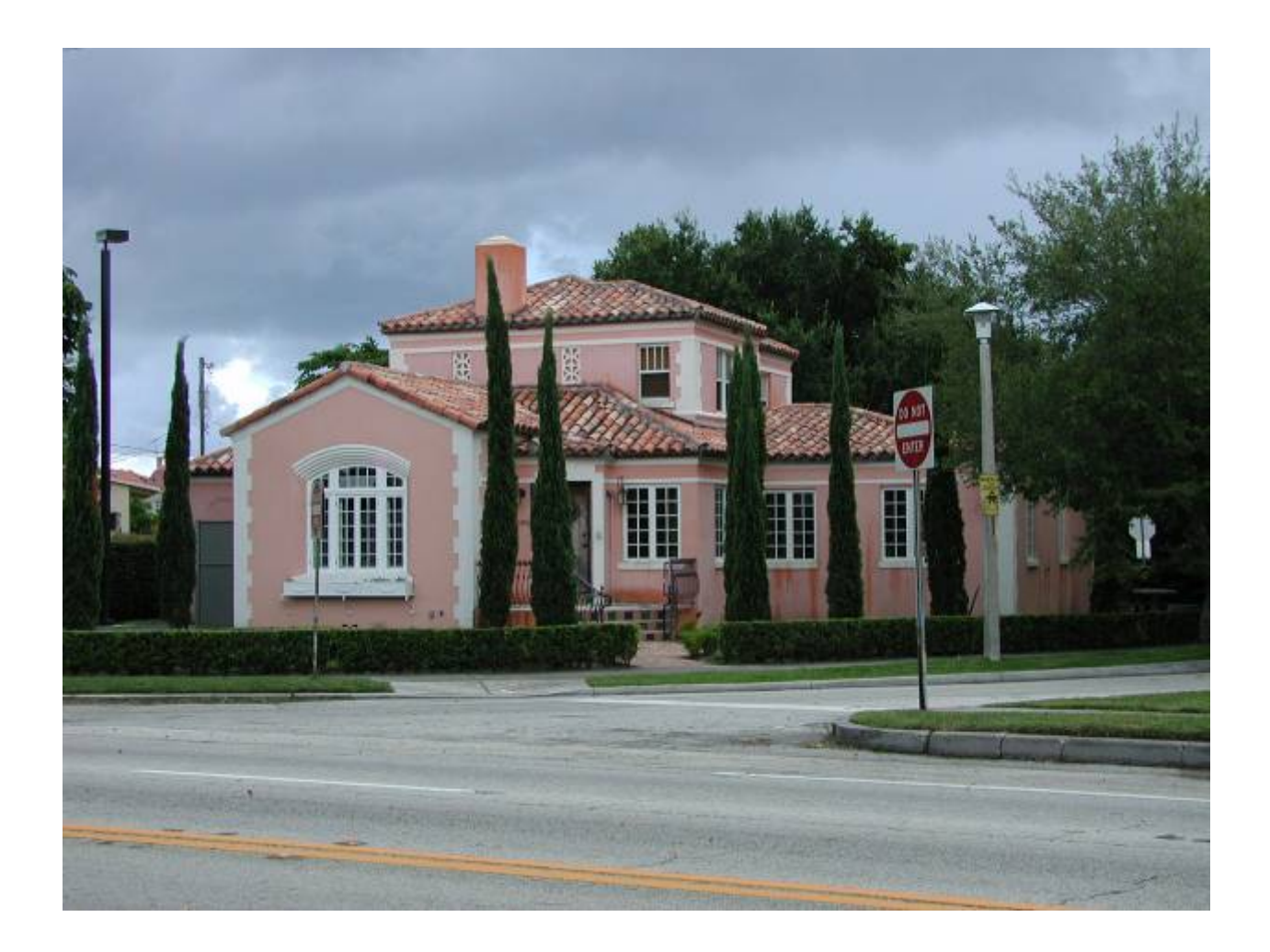
Figure 1. 5801 Biscayne Boulevard, 1932 Mediterranean Revival