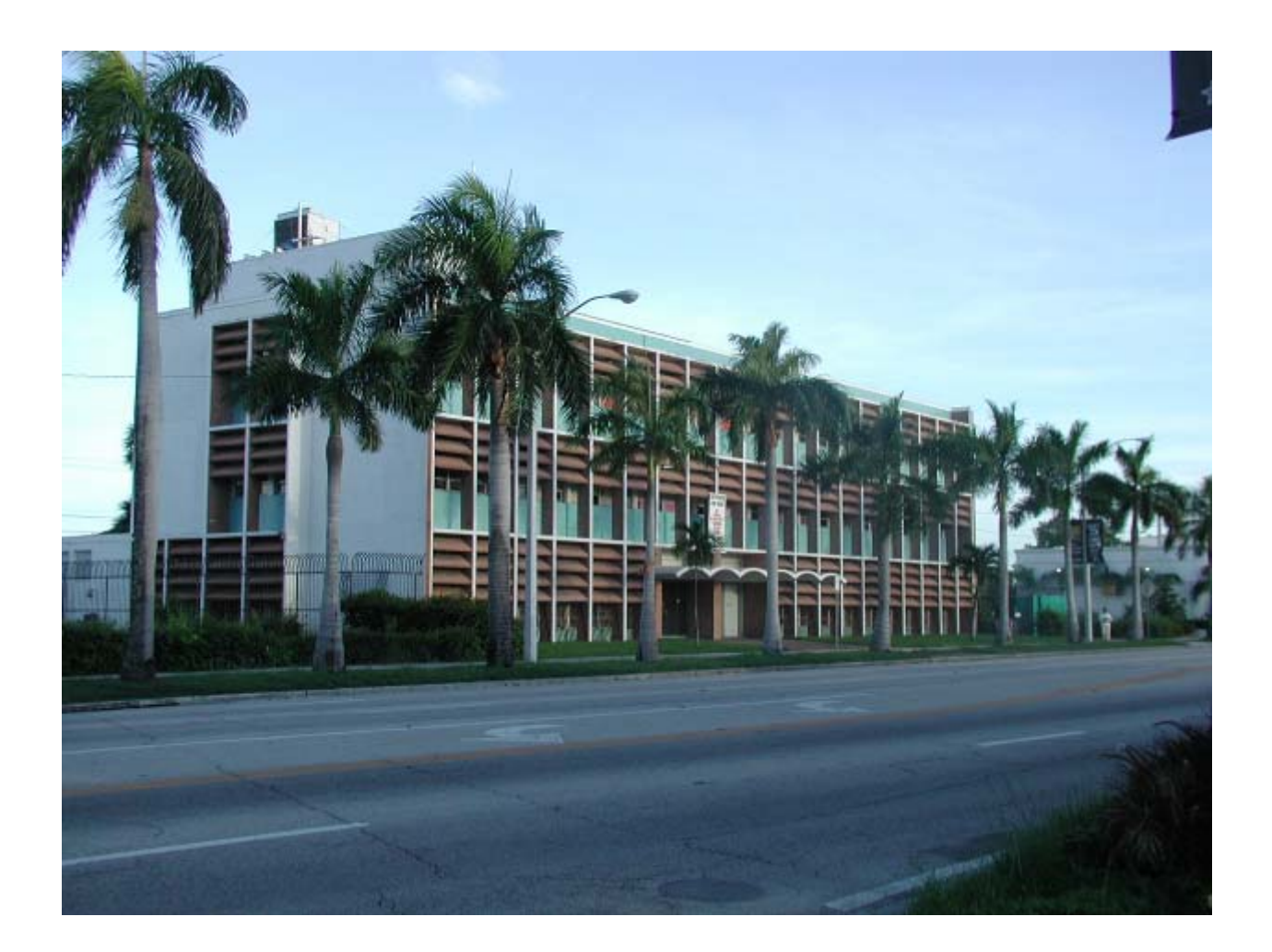
Figure 4. Originally The Maule Building (now demolished) 5220 Biscayne Boulevard, 1954