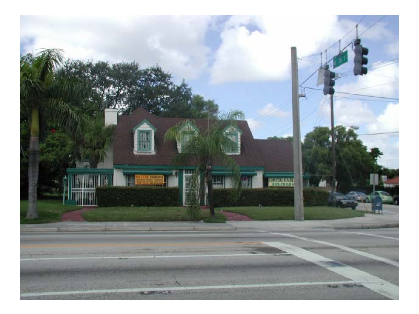
Figure 6. 7550 Biscayne Boulevard, 1935