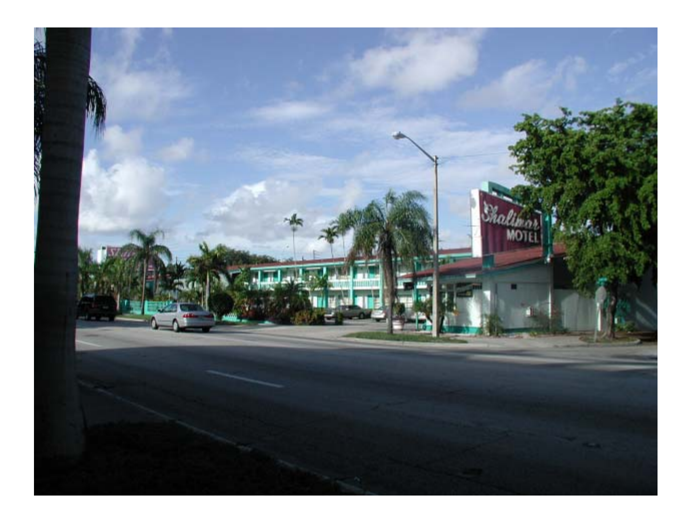
Figure 7. The Shalimar Motel 6200 Biscayne Boulevard, 1950 Miami Modern