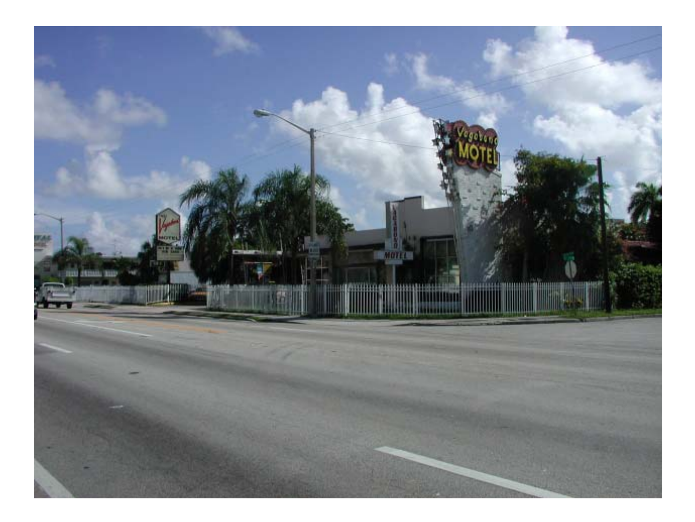
Figure 9. The Vagabond Motel 7301 Biscayne Boulevard, 1953 Miami Modern