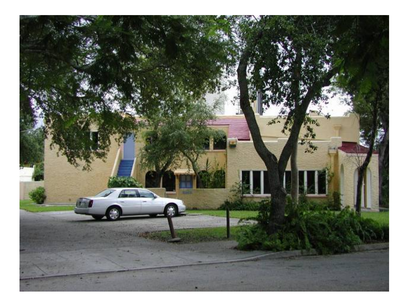
Figure 11. Originally a Single Family Residence 5859 Biscayne Boulevard, 1924 Mediterranean Revival