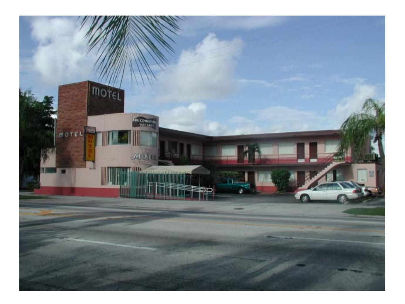
Figure 8. Originally The New Yorker Hotel 6500 Biscayne Boulevard, 1953 Miami Modern