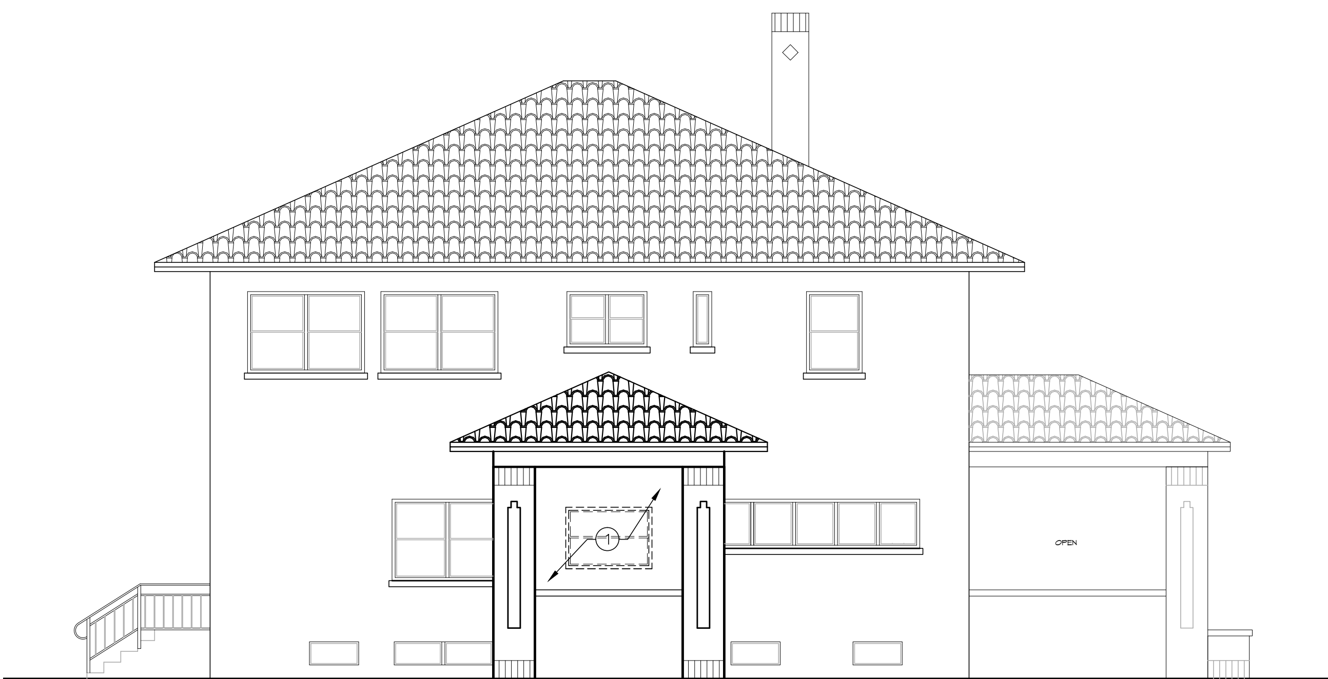
4 LEFT ELEVATION SCALE: 3/16" = 1'-0"