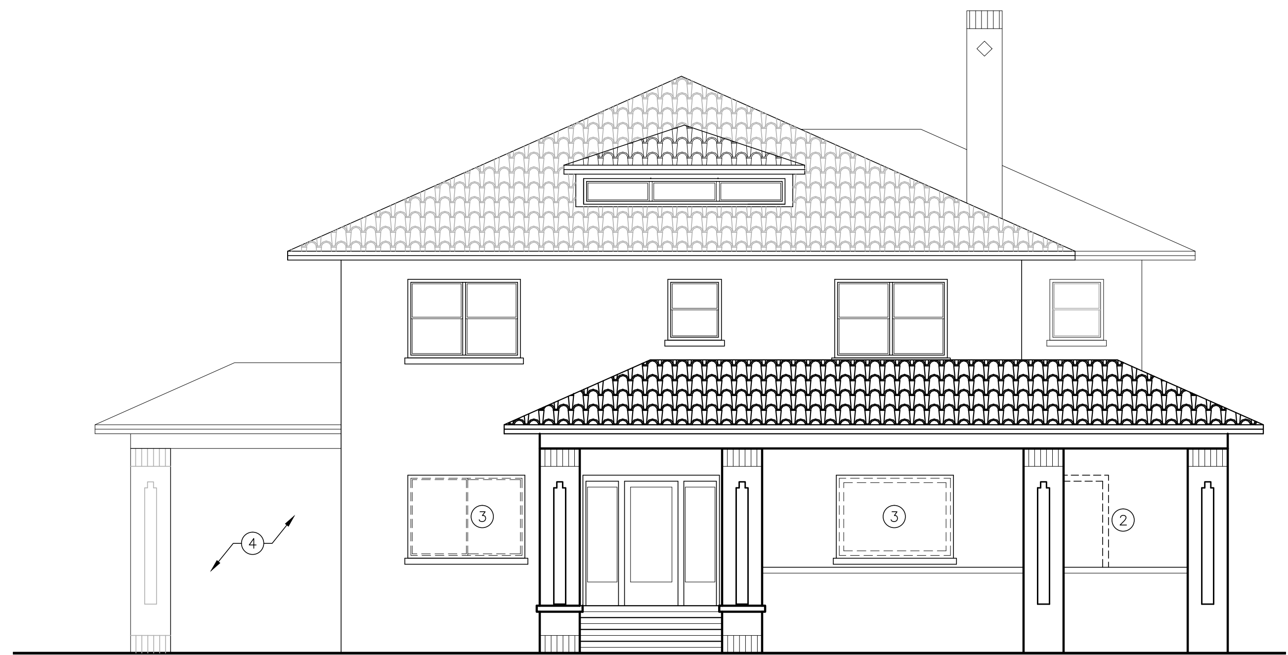
1 FRONT ELEVATION SCALE: 3/16" = 1'-0"

architecture studio great design shapes the future 1823 east fort king street, suite 102 ocala, florida 34471 p: (352) 620-0944 f: (352) 620-0996 www.sosarchitect.com florida license: aa26002579 sosaa@sosarchitect.com