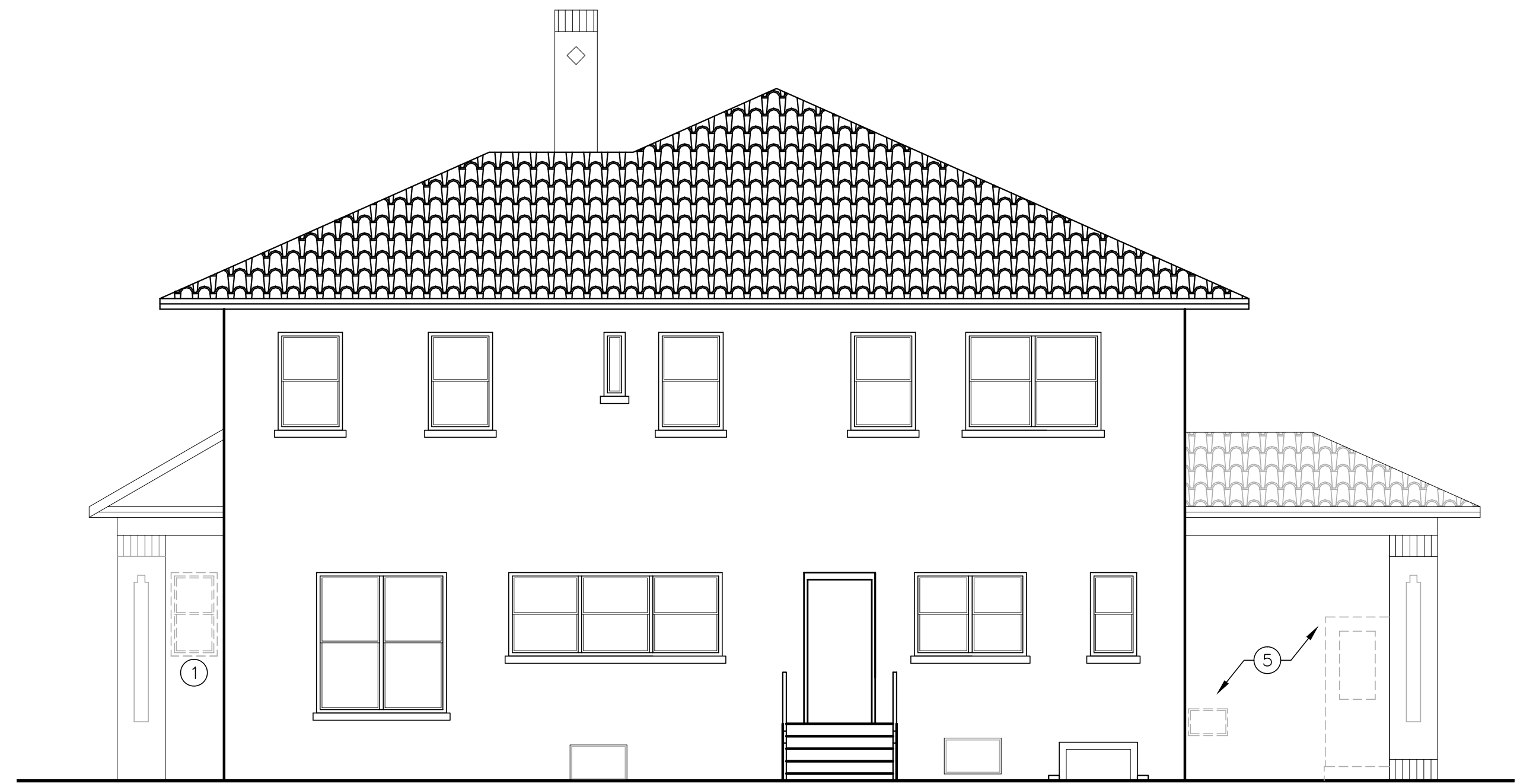
2 REAR ELEVATION SCALE: 3/16" = 1'-0"