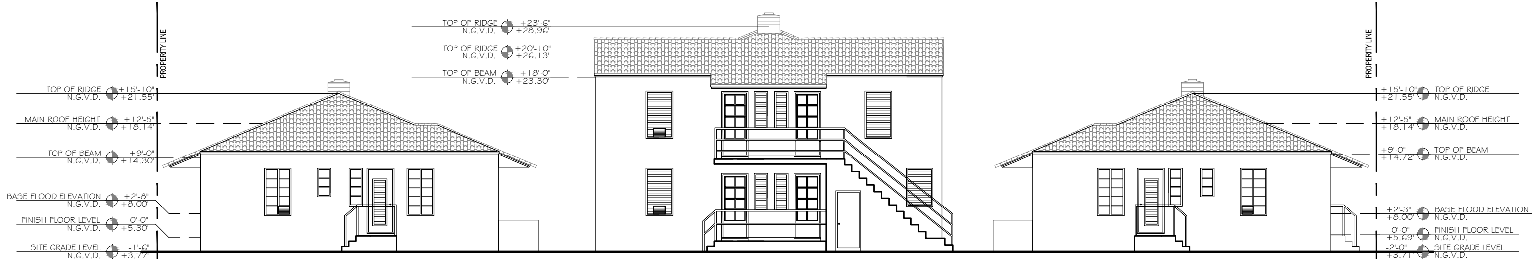
1 EXISTING EAST ELEVATION SCALE: 3/32" = 1'-0"