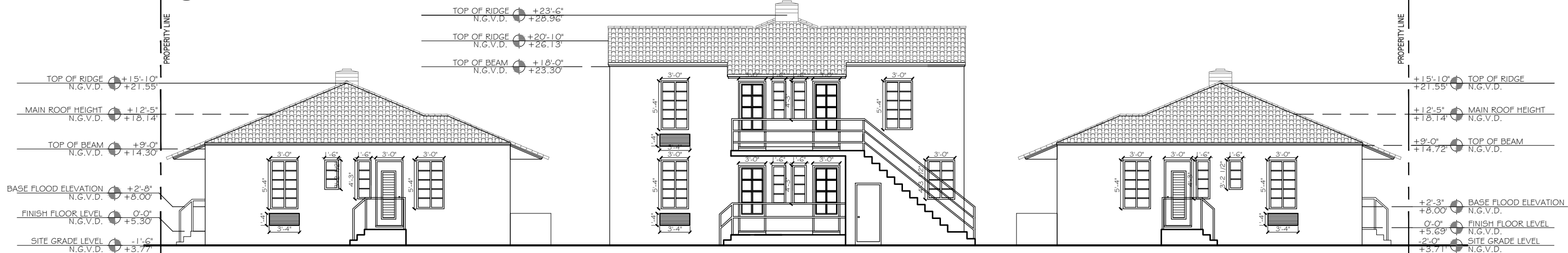
3 PROPOSED EAST ELEVATION SCALE: 3/32" = 1'-0"

CLIENT: 835 ALTON RD 835 Alton Road Miami Beach, FL 33139-5568 Folio: 02-4203-014-0430