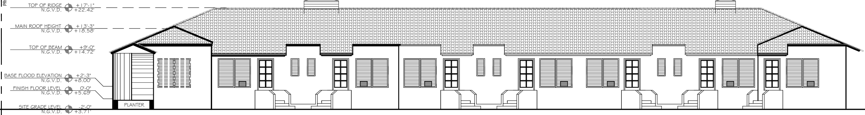
1 EXISTING NORTH ELEVATION SCALE: 3/32" = 1'-0"