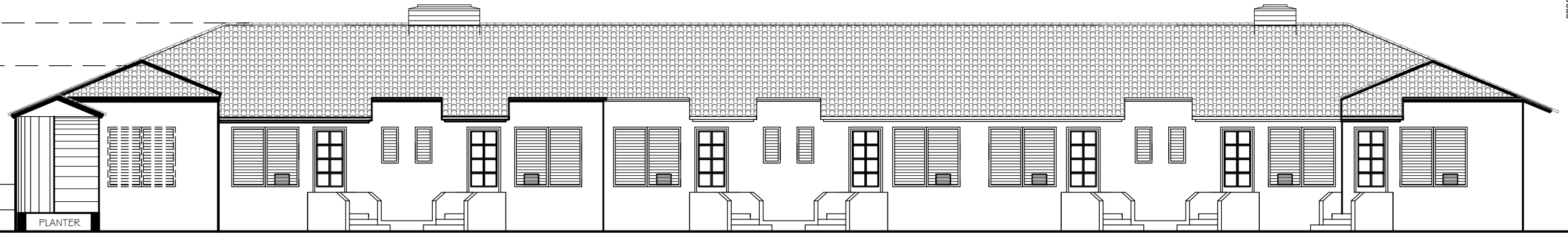
1 EXISTING SOUTH ELEVATION SCALE: 3/32" = 1'-0"

TOP OF RIDGE N.G.V.D. +17'-1" +22.42' MAIN ROOF HEIGHT N.G.V.D. +13'-3" +18.58' TOP OF BEAM N.G.V.D. +9'-0" +14.72' BASE FLOOD ELEVATION N.G.V.D. +2'-3" +8.00' FINISH FLOOR LEVEL N.G.V.D. 0'-0" +5.69' SITE GRADE LEVEL N.G.V.D. -2'-0" +3.71'