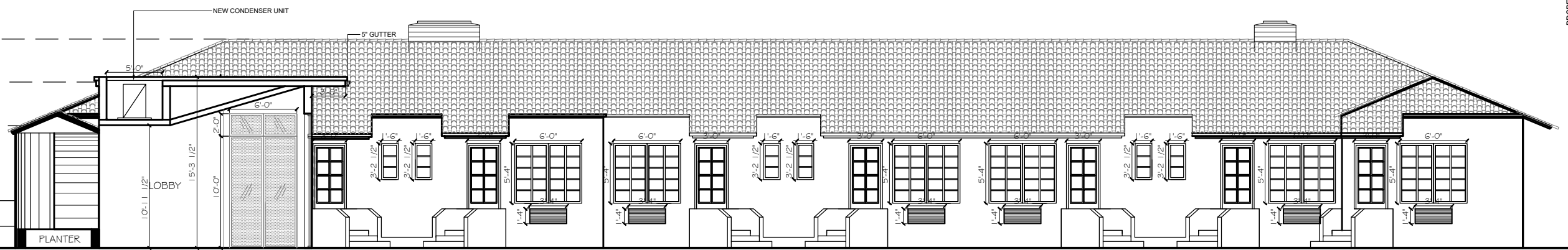
3 PROPOSED SOUTH ELEVATION SCALE: 3/32" = 1'-0"

TOP OF RIDGE N.G.V.D. +17'-1" +22.42' MAIN ROOF HEIGHT N.G.V.D. +13'-3" +18.58' TOP OF BEAM N.G.V.D. +9'-0" +14.72' BASE FLOOD ELEVATION N.G.V.D. +2'-3" +8.00' FINISH FLOOR LEVEL N.G.V.D. 0'-0" +5.69' SITE GRADE LEVEL N.G.V.D. -2'-0" +3.71'