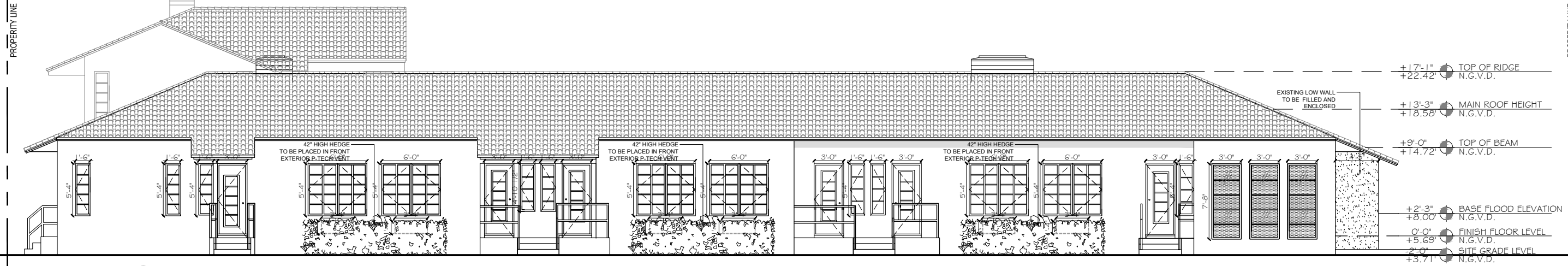
3 PROPOSED NORTH ELEVATION SCALE: 3/32" = 1'-0"

CLIENT: 835 ALTON RD 835 Alton Road Miami Beach, FL 33139-5568 Folio: 02-4203-014-0430