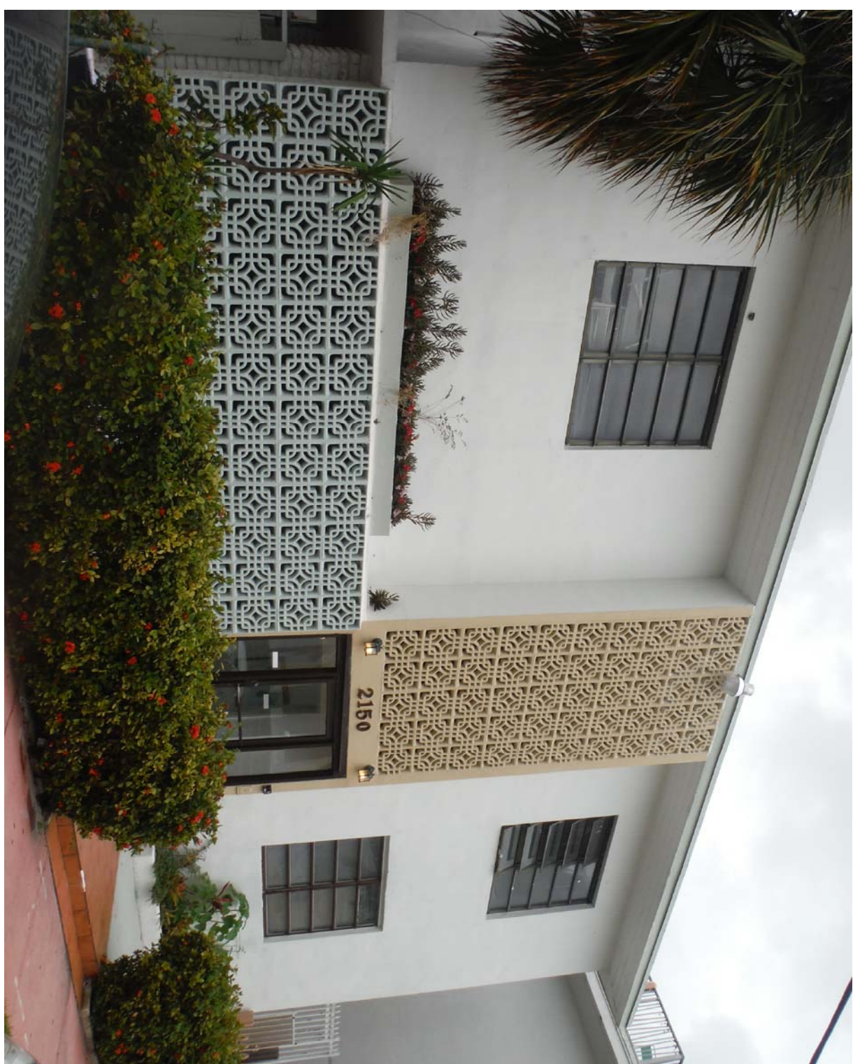
SOUTHWEST/ FRONT VIEW (ALONG PARK AVE)