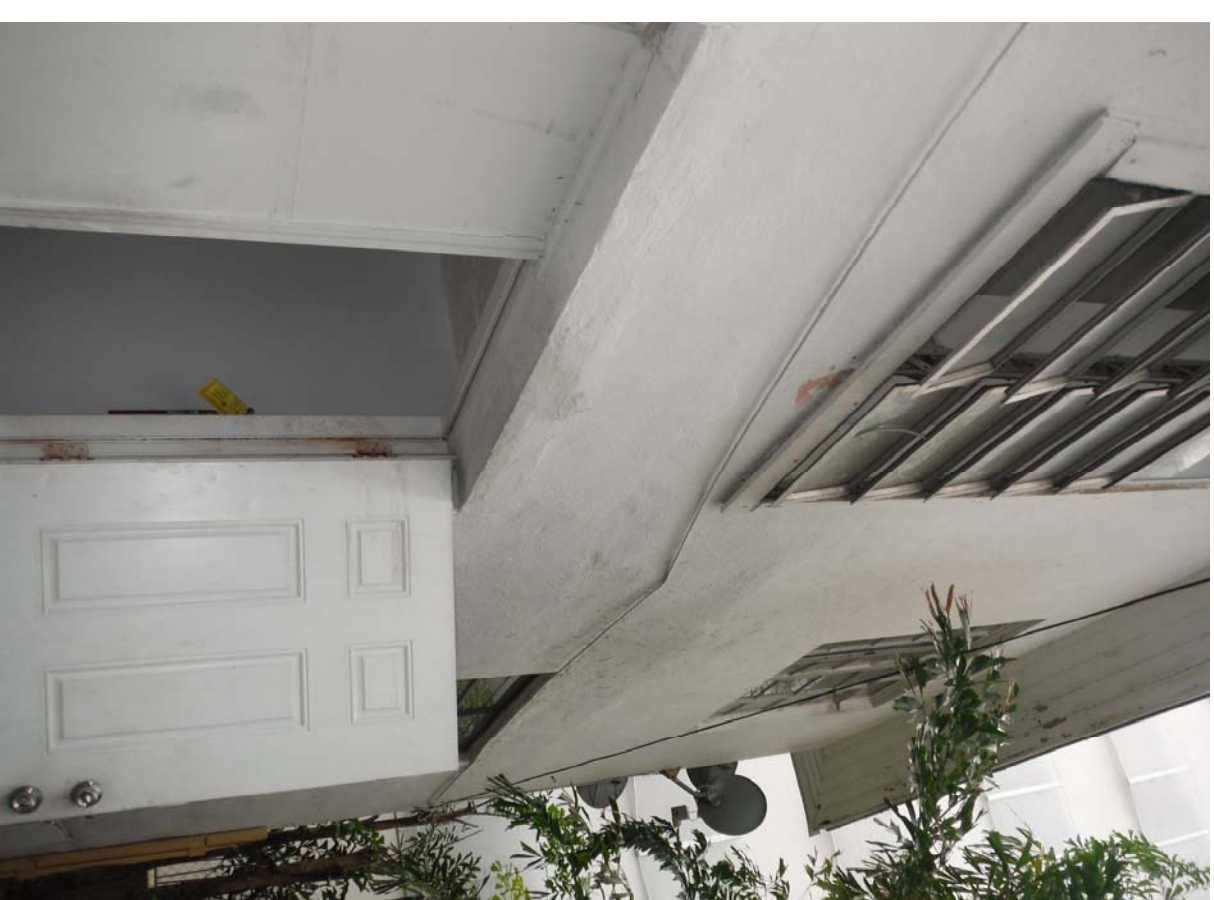
EXISTING NORTHWEST (REAR) VIEW