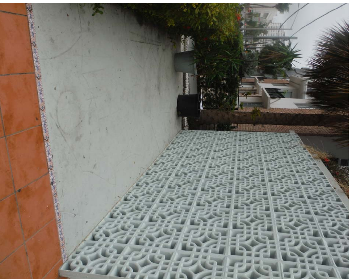
EXISTING FRONT ENTRY WALK (LOCATION OF NEW INCLINED WALKWAY ALONG PARK AVE)