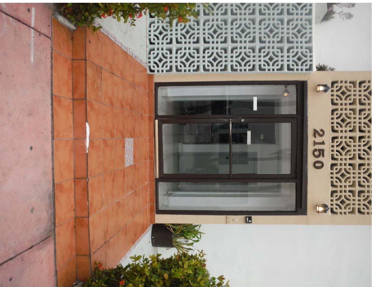
FRONT ENTRANCE (ALONG PARK AVE)