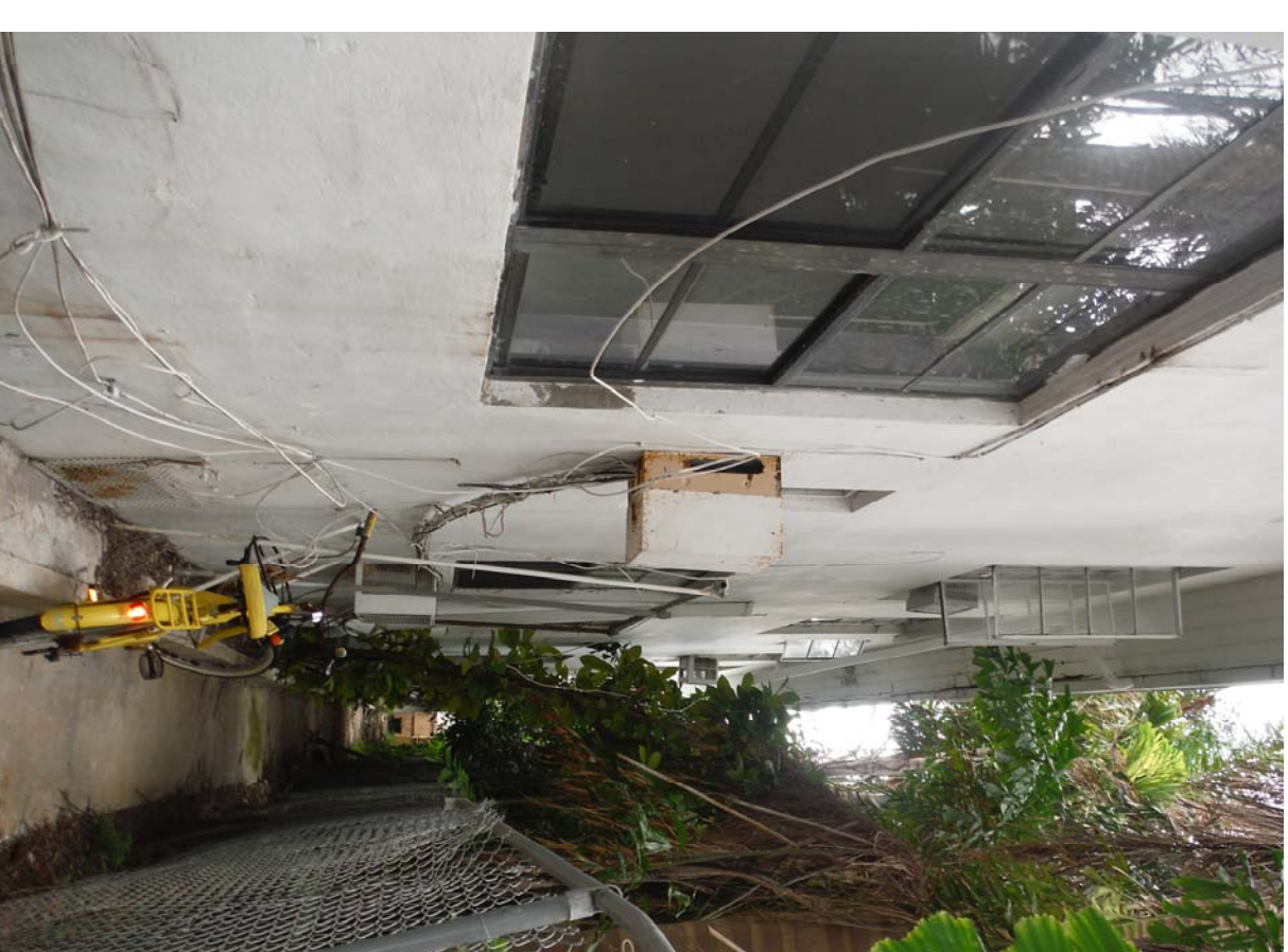
EXISTING NORTHEAST (SIDE) VIEW