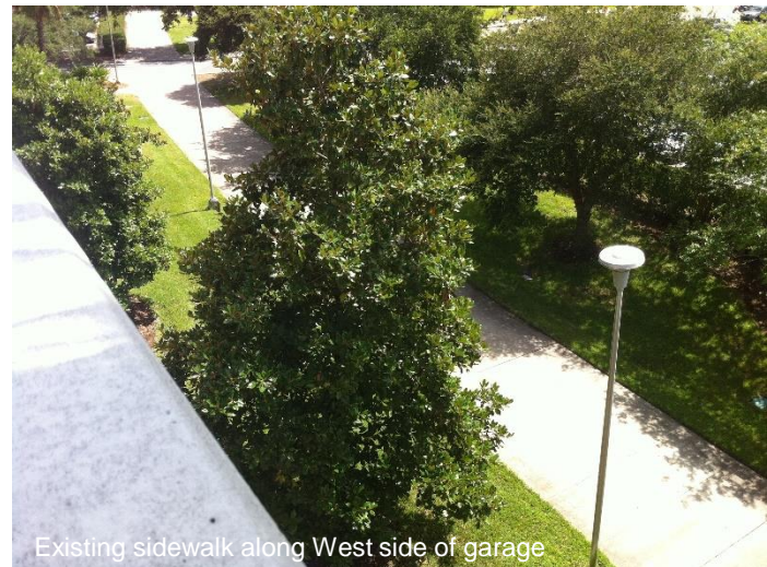
Existing sidewalk along West side of garage