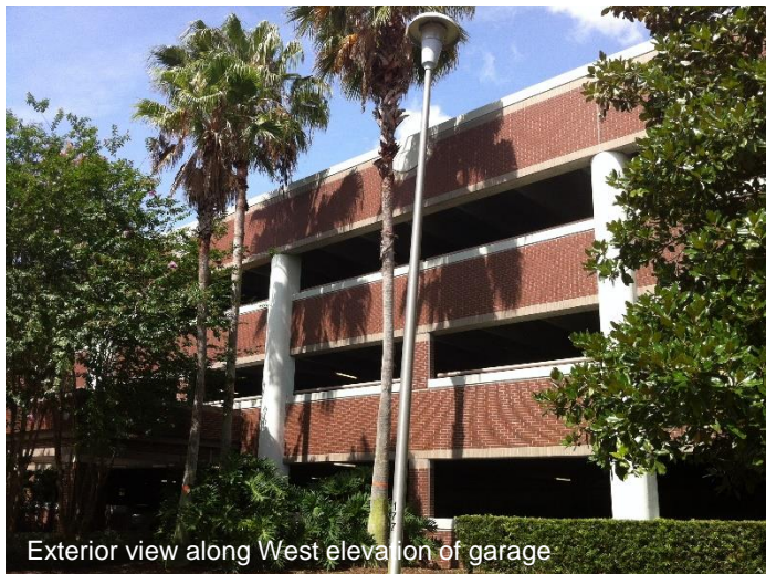
Exterior view along West elevation of garage