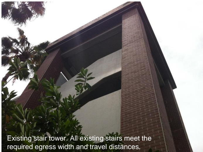
Existing stair tower. All existing stairs meet the required egress width and travel distances.