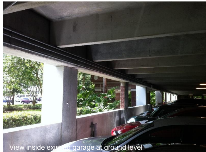
View inside existing garage at ground level