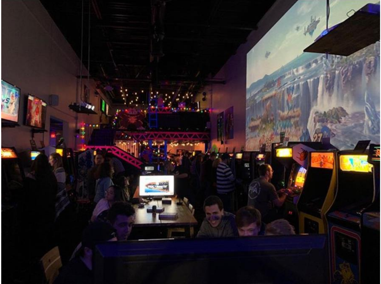
View of Mezzanine Room Bottom Floor Looking at

Description: Arcade Cabinets along the walls. Multiple TV's connected to consoles and projectors. Space to sit and mingle in the middle of the room. A mezzanine is above the pinball room in the back. There are 3 couches up there with additional overflow seating and a couple TVs. Each of the games upstairs can be accessed downstairs. The only way up currently is the stairway. Putting an elevator lift where needed will be difficult for current configuration as it will block access to the pinball room below the mezzanine. This mezzanine is identical to the one next door which has had a waiver application approved.