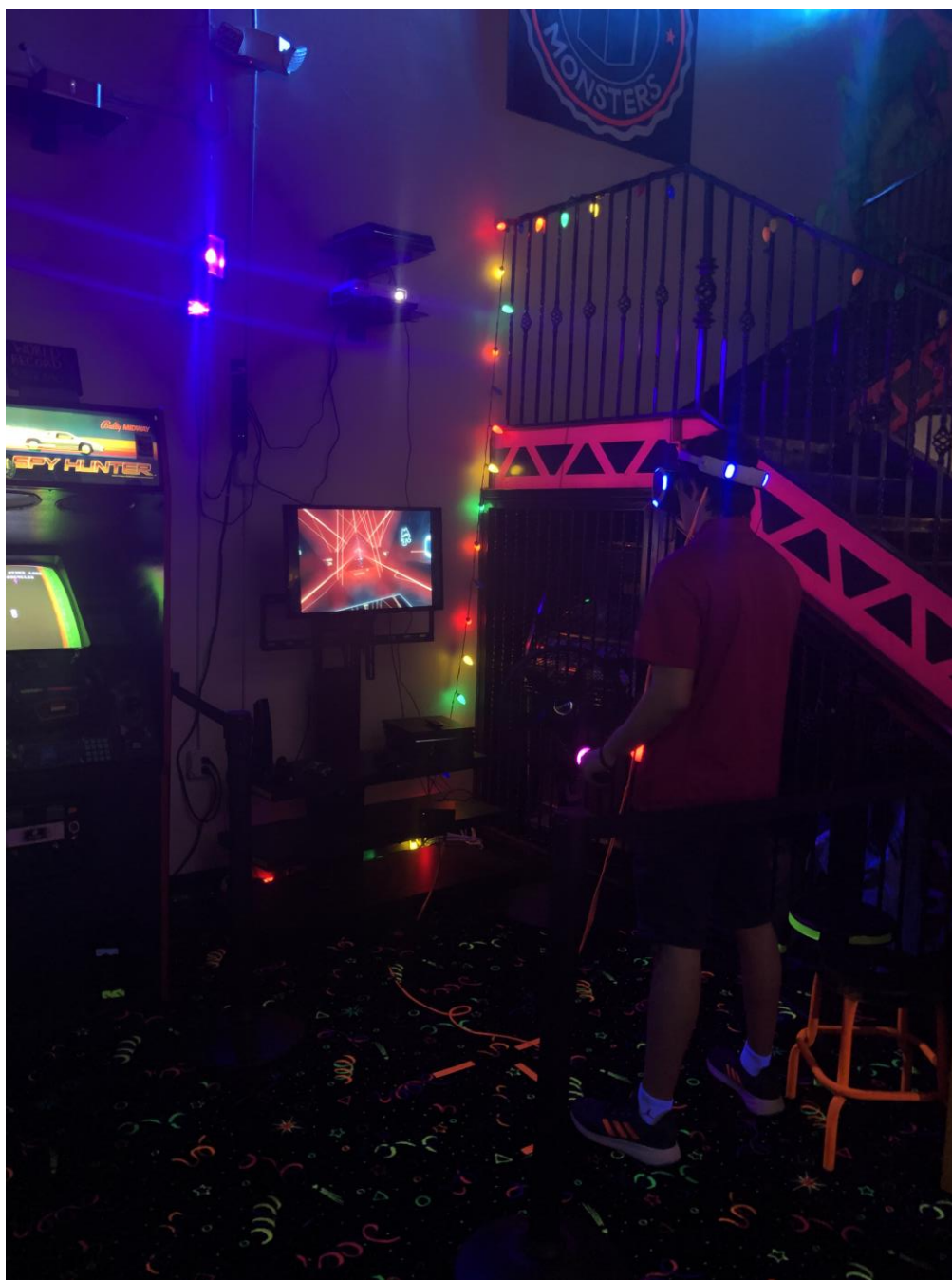
Example of another console space downstairs with VR setup

Description: Shows a young man playing Beat Saber on a Playstation 4. This area has plenty of room and can be configured as needed to give accessible access to anyone. There are multiple areas downstairs with access to these experiences on console.