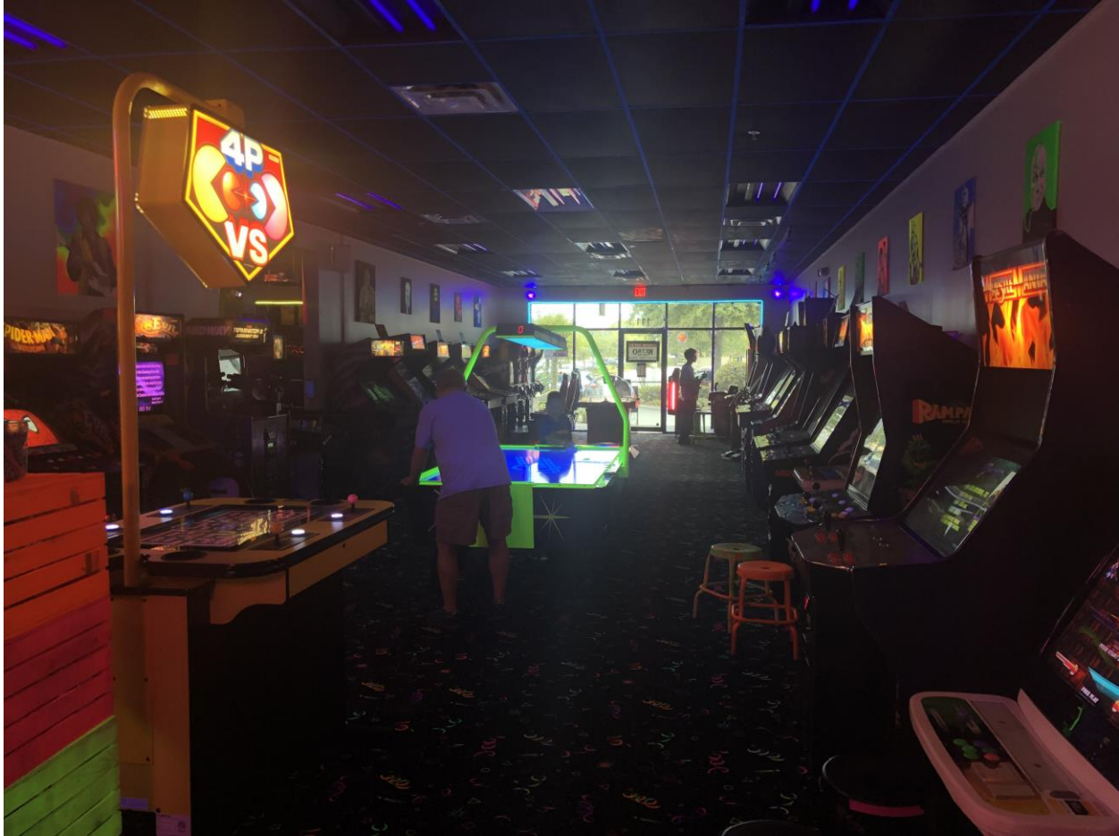
View of the other room in Arcade Monsters

Description: This is the main room for arcade units. Each cabinet is unique and fits alongside the wall. All games are housed downstairs and the top area is only used for duplicate consoles (there are multiple downstairs with plenty of seats for those wishing to use them) and overflow seating.