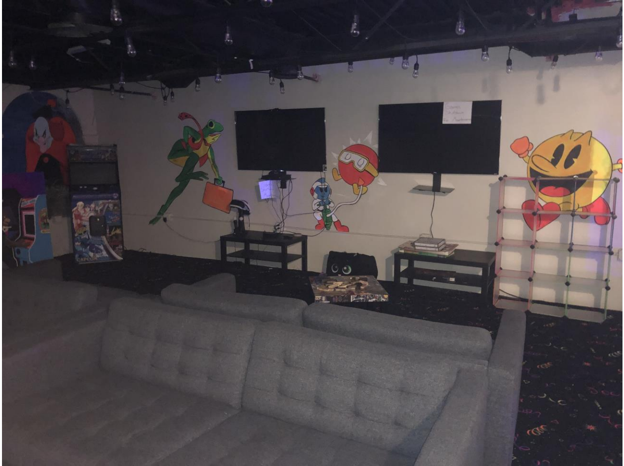
View of upstairs mezzanine area

Description: There are 3 couches for additional seating along with some extra console units to help with overflow for crowds. This allows us to prioritize access downstairs to those who need it. It also allows us to fit more kids into the space safely to enjoy the arcade.