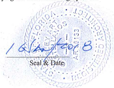
Seal & Date