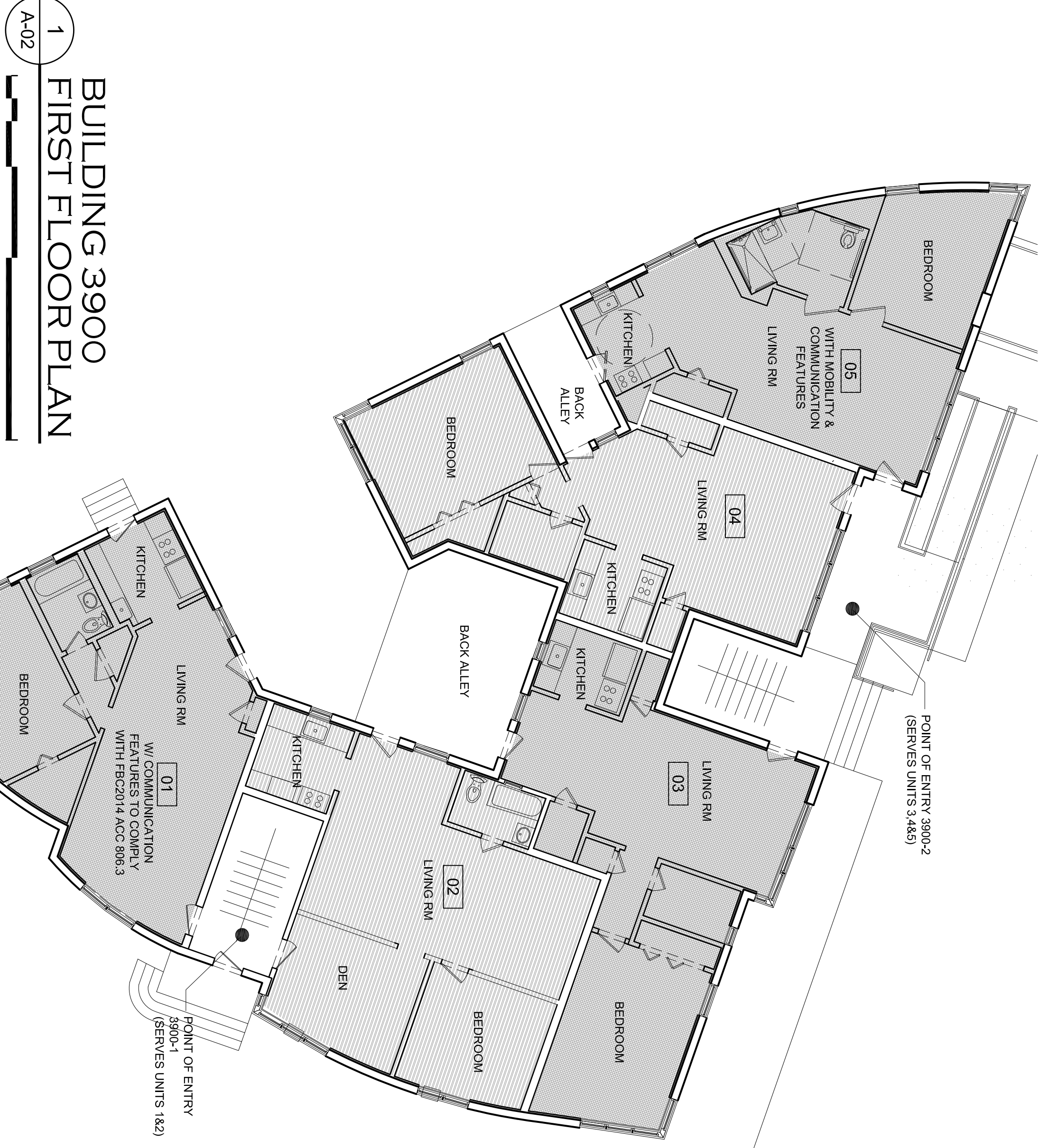
1 BUILDING 3900 FIRST FLOOR PLAN