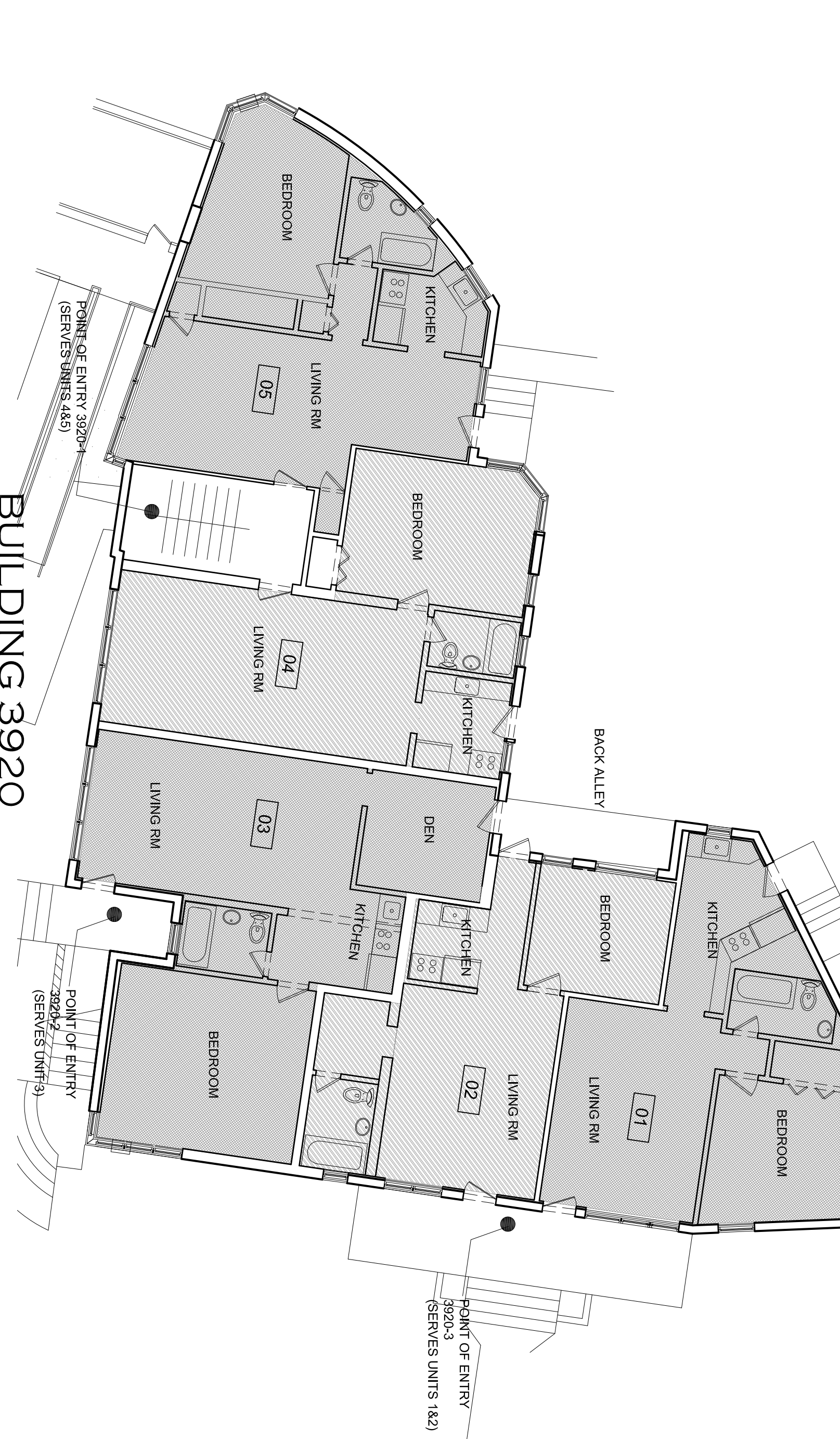
3 BUILDING 3920 FIRST FLOOR PLAN