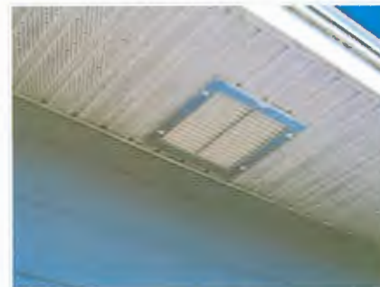
Home ventilation system outdoor air intake grille under roof eave (intakes can also be found in other locations).

If you received this postcard we believe your home qualifies for the study: